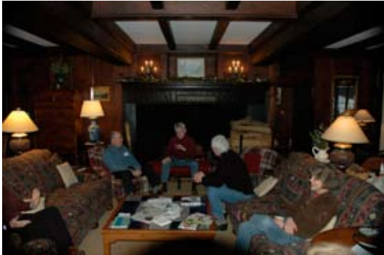
Minary Living Room