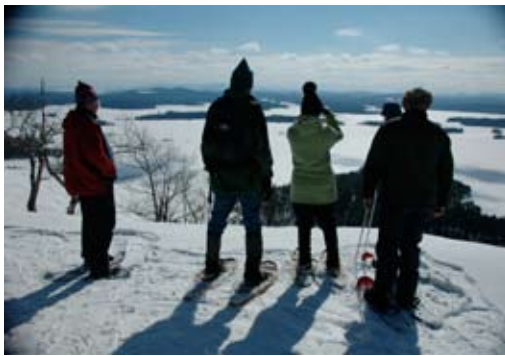
Squam Lake view from Rattlesnake Hill