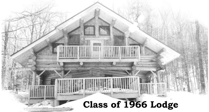
Class of 1966 Lodge