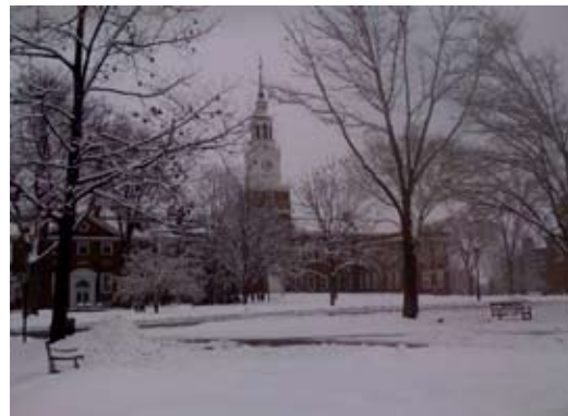
Baker on the 67th Morning, 2009