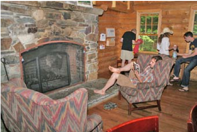
New couches at Lodge