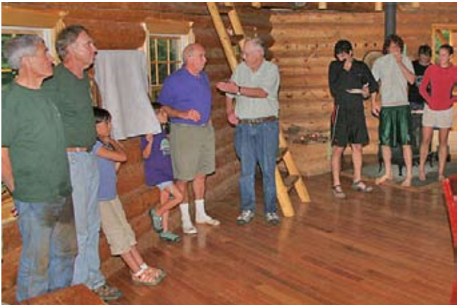
Before the "Unveiling"